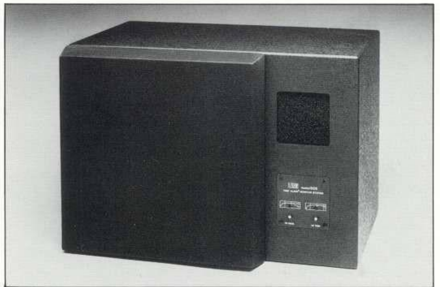
Model 809A shown with optional grille (809GA).